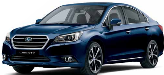
LAPIS BLUE PEARL