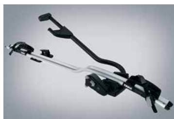
THULE PRORIDE: ROOF MOUNTED / RECOMMENDED FOR CARBON FRAMES 6