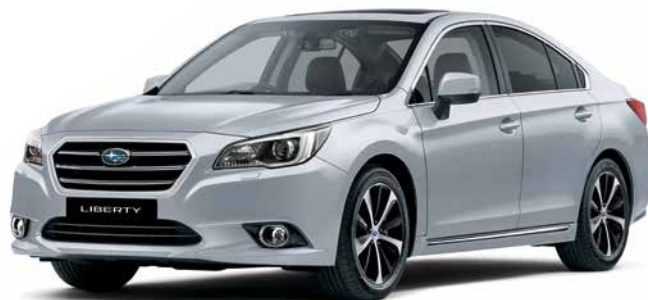
ICE SILVER METALLIC