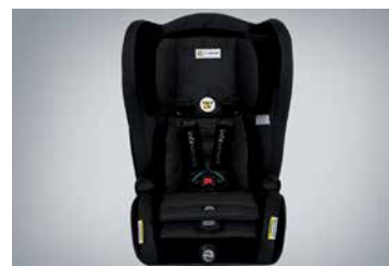
BABY SEAT - INFASECURE 4