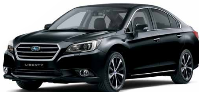
CRYSTAL BLACK SILICA