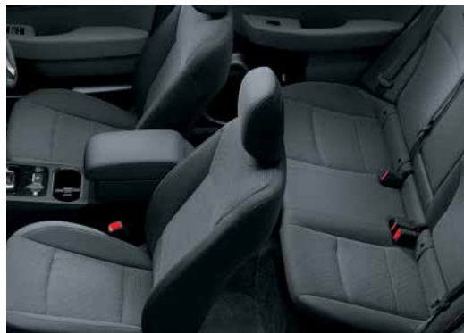
BLACK CLOTH: Liberty 2.5i