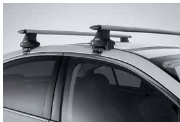
THULE ROOF CROSS BARS