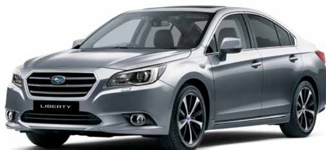
PLATINUM GREY METALLIC