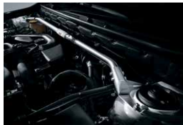
STI FLEXIBLE TOWER BAR