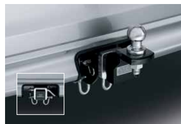
TOWBAR KIT AND BLANKING CAP