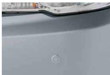
FRONT PARKING SENSORS