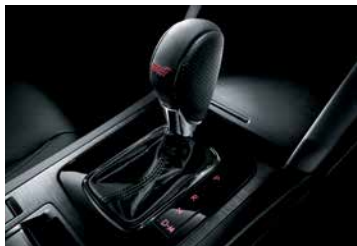
STI SHIFT KNOB CVT