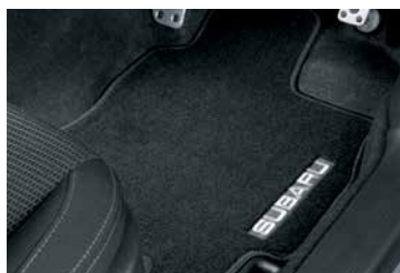
CARPET FLOOR MAT SET