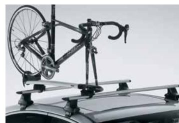
THULE SPRINT: ROOF MOUNTED / DIRECT FORK MOUNT 6

1. Subaru Australia reserves the right to vary vehicle specifications, accessory range and standard features in Australia from those detailed in this brochure. Vehicles shown in this brochure may be fitted with accessories available at additional cost. For full warranty, pricing and applicability information visit us at subaru.com.au . 2. STI Front Under Spoiler shot on a Liberty with optional accessory grill. 3. Mud-guard applicability varies by model. Refer to your dealer for correct compatibility for your chosen model. 4. Accurate as of February 2016. Baby seat model availability and specification subject to change. Please check with your Subaru dealer for new baby seat product introductions. 5. Thule product shot Subaru XV, vehicle specifications differ to Liberty. 6. Roof cross bars required.