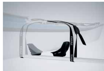
THULE KAYAK CARRIER 6