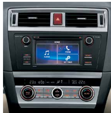
INTEGRATED INFOTAINMENT: Liberty 2.5i