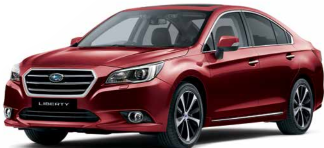
VENETIAN RED PEARL