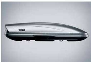
THULE MOTION XL (800) ROOF BOX (SILVER GLOSS OR BLACK GLOSS) 2