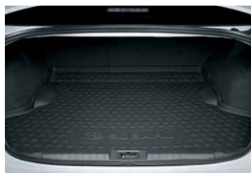
CARGO TRAY (LOW DISH)