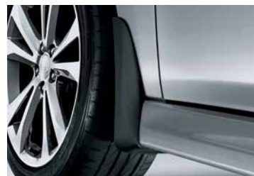
MUD GUARDS FRONT & REAR 3