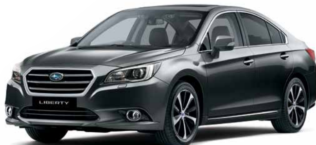
DARK GREY METALLIC