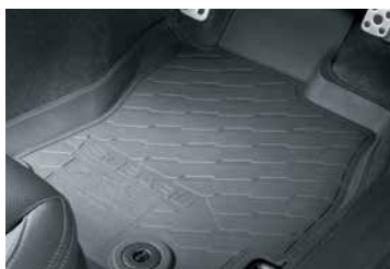
RUBBER FLOOR MAT SET