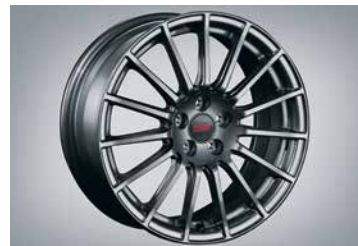
STI ENKEI ALLOY WHEEL SET - GUN METAL