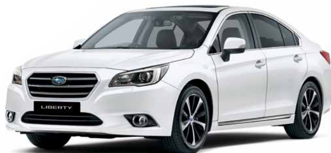
CRYSTAL WHITE PEARL