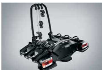
THULE VELOCOMPACT 927, 3 BIKE TOWBAR MOUNTED CARRIER