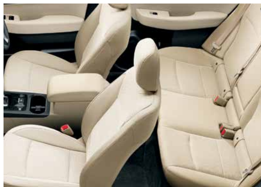
IVORY CLOTH: Liberty 2.5i