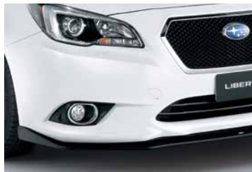
STI FRONT UNDER SPOILER 2

SUBARU.COM.AU FOR FULL DETAILS ON THE TAILOR-MADE ACCESSORIES AVAILABLE FOR YOUR SUBARU MODEL.